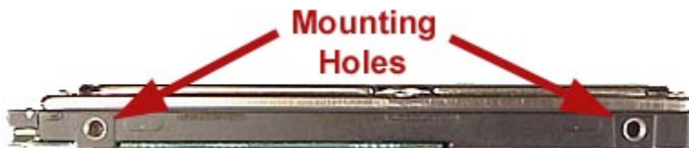
Figure 2.HDD Mounting Holes

Important Note: Disconnect power from your computer system before beginning installation.